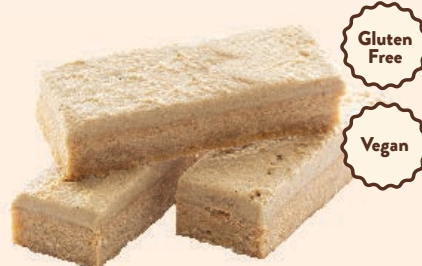
GINGER CRUNCH FINGER SLICE 30's