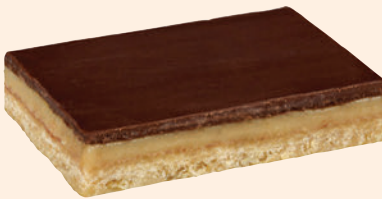
CHOC CARAMEL SLICE

Available in a box of 28 pre-cut slices.