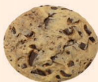
DOUBLE CHOC CHIP