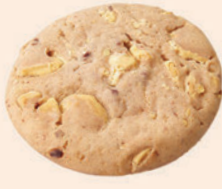
RASPBERRY & WHITE CHOC