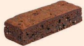
BROWNIE FINGER SLICE CHOC FUDGE 30's