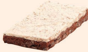
COOKIES & CREAM SLAB