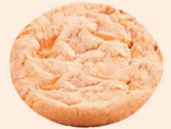
WHITE CHOC CARAMEL