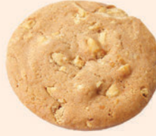
WHITE CHOC MACADAMIA NUT