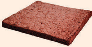
BROWNIE CHOC FUDGE SLAB