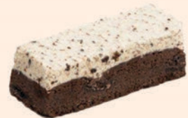
COOKIES & CREAM FINGER SLICE 30's