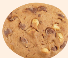
MILK CHOC MACADAMIA NUT