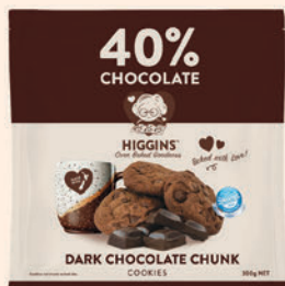
DARK CHOCOLATE CHUNK