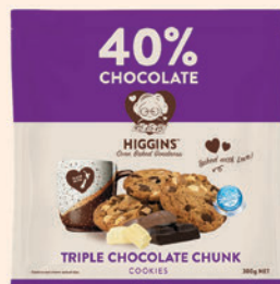
TRIPLE CHOCOLATE CHUNK