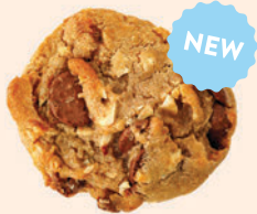
MILK CHOCOLATE ALMOND