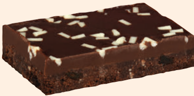
CHOC FUDGE SLICE