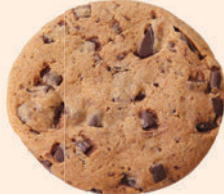
CHUNKY CHOC CHIP