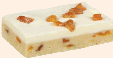
APRICOT CITRUS SLICE