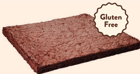
BROWNIE SLAB CHOC FUDGE GF