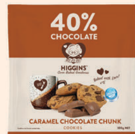
CARAMEL CHOCOLATE CHUNK